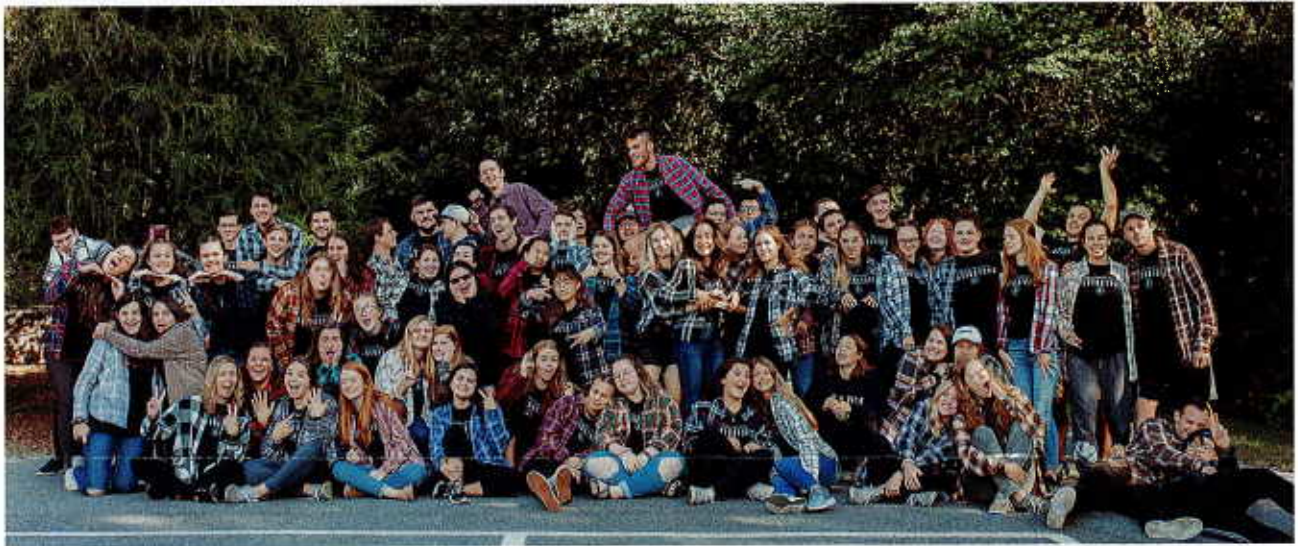
Our Millersville Navigators group picture from our 2021 fall retreat with Bowie State Navigators. We had 70 people attend for the weekend!

Numbers however don't begin to tell the whole story. These students have already begun to buy into our Millersville Navigators culture. They are eager to know Christ! Our student leaders are overwhelmed with students in their Bible studies and younger students asking for time with them to hear what God is teaching them. Some of these students are hearing about the good news of Jesus for the first time! During the retreat, one of our student leaders shared about how one of her girls decided she was done fighting Jesus and wanted to commit to following him for the rest of her life!