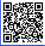
Millersville Bible Camp Registration 2026